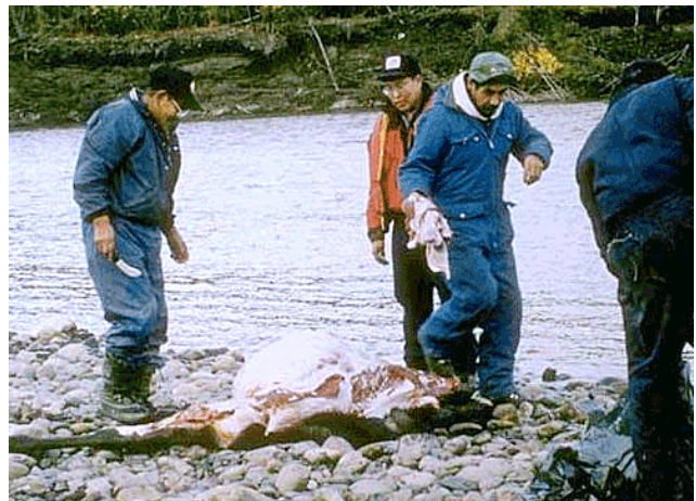
Successful Hunt (RWED, GNWT)

There is also a need for more public conservation education about wildlife and wildlife management issues. Greater public education about our wildlife resources will result in a greater appreciation and hopefully greater use of the resource. This would increase both the social and economic benefits derived from wildlife and promote more responsible use of our resources.