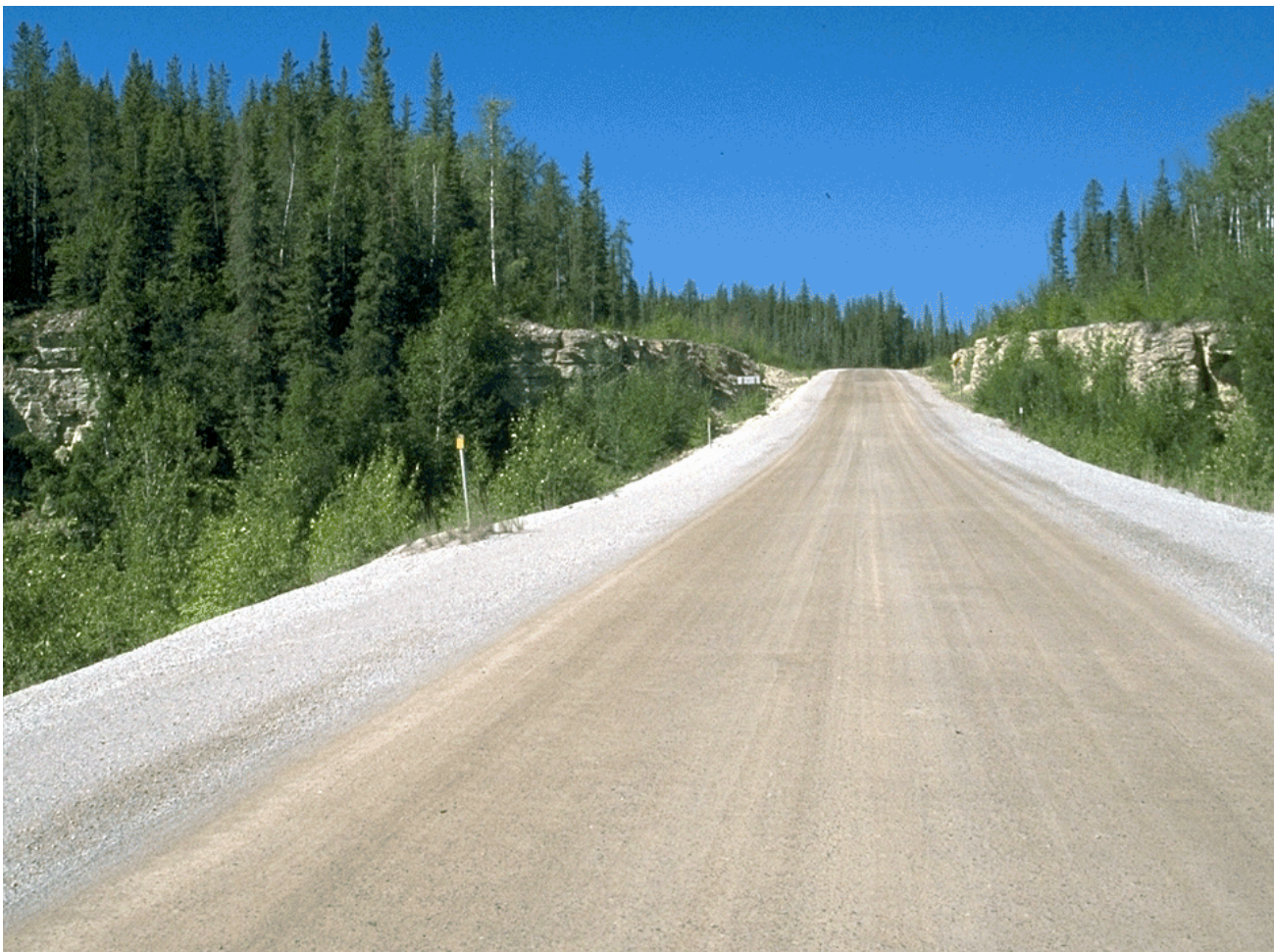
Road to Simpson (RWED, GNWT)

The responsibility of government to continue to improve environmental assessment and monitoring capability is an essential element of public and industrial infrastructure development. Mitigating the effects on the environment must continue to be a requirement of such developments.