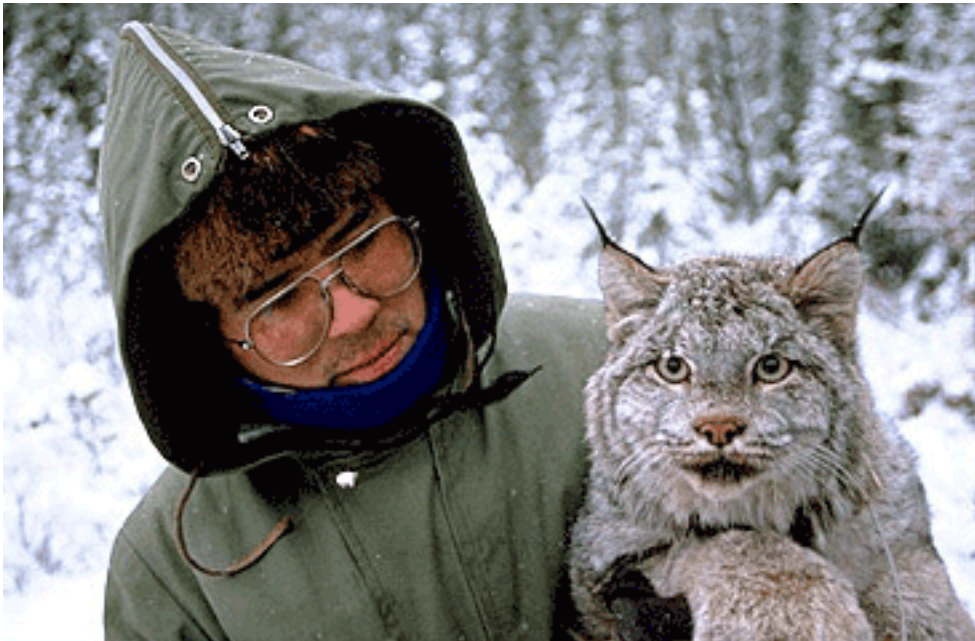
Biologist with Lynx (RWED, GNWT)

Wildlife populations will require continued monitoring to ensure sustainable harvest levels are not exceeded and that underutilized resources can be identified for possible commercial use. With careful management and responsible use, the wildlife sector will continue to enhance the wealth and the well being of our residents.