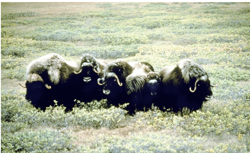
Muskox Grazing (RWED, GNWT)

In an effort to offset some of the negative impacts of falling prices, there have been a number of initiatives to increase the utilization of NWT fur products, including development of the manufacturing and craft sectors, and promotion of fur both inside and outside the NWT.