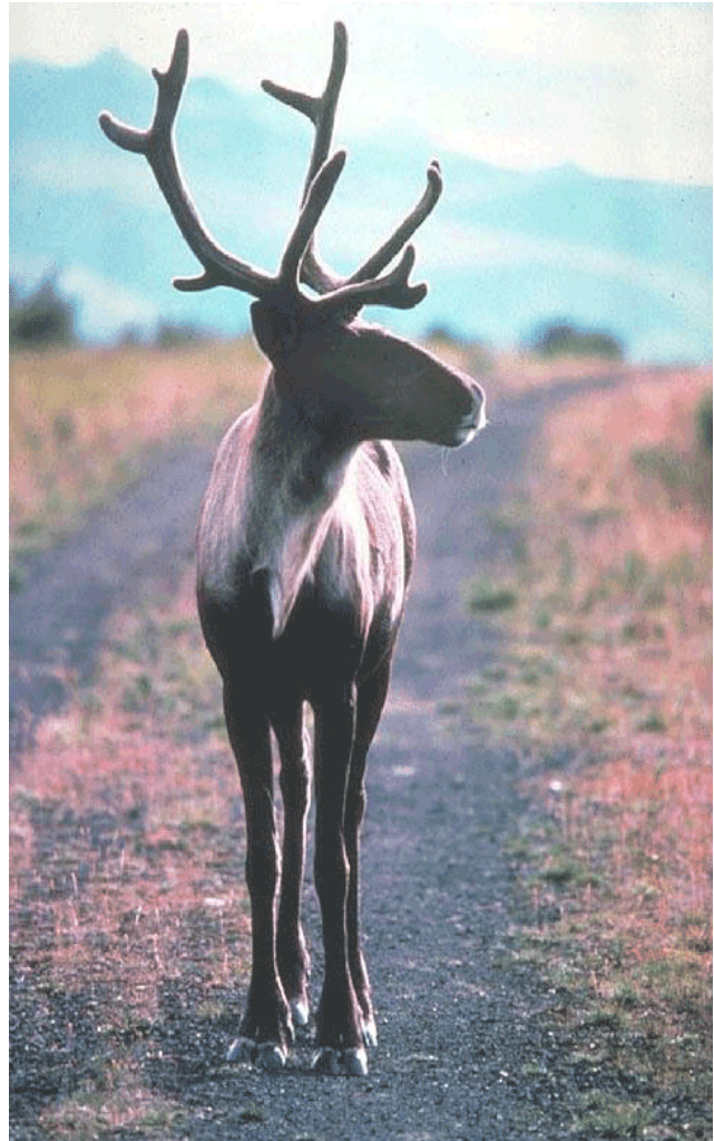
Caribou Crossing (RWED, GNWT)

The outfitting industry witnessed early difficulties with initial reports of border closures to trophies taken from the NWT. Initially game meat for export was included in the sanctions being applied to the Canadian industry. Successful interventions by the Governments of Canada and the NWT saw these sanctions reversed. Like with commercial game meat, trophies were eventually allowed entry into foreign markets as these animals were determined not to be farm fed animals. Border vigilance continues to be very high and the extra effort in time and energy to deal with this has proven costly to northern operators and resulted in some delays.