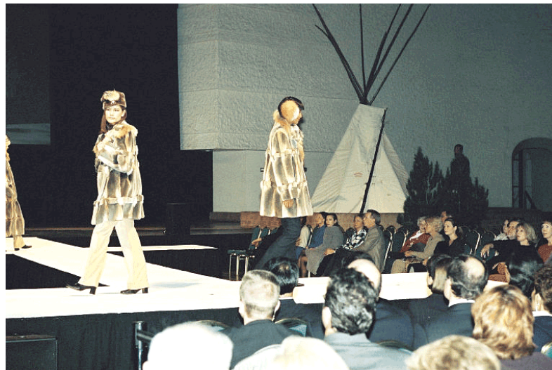
NWT Fashion Show in Europe (RWED, GNWT)

Trends in other sectors have also had an impact on wildlife and fur. For example, the increased interest in non-renewable resource exploration and development has highlighted the need for good quality baseline data on wildlife and habitat, and the need for an integrated approach to resource management and development.