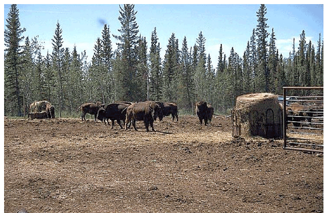
NWT Buffalo Ranch (RWED, GNWT)

Live wood bison export provides the highest return. A reasonable market for bison meat does exist, but the export of live animals provides up to five times the return compared to meat. The market may get even stronger if an initiative to allow wood bison imports into the USA is successful. The trade of these animals is currently suspended as a result of the outbreak of BSE. Once these trade barriers are removed, the live export of wood bison may offer significant returns to the NWT. The reindeer herd near Tuktoyaktuk has just recently initiated commercially harvesting again after a long absence for the marketplace. Price remains a determining factor in the development of this sector. Overhead costs of getting product to market are very high because of the level of investment required to stage and process a major harvest. Some major pieces of specialized equipment are underutilized for the rest of the year. Higher prices may be achieved as products gain broader market acceptance. Better returns may also be achieved if infrastructure is used for longer periods of time and value-added processing, which would generate increased wages, took place in the North. The emergence of qiviut only serves as positive evidence of this in the musk-ox meat industry.