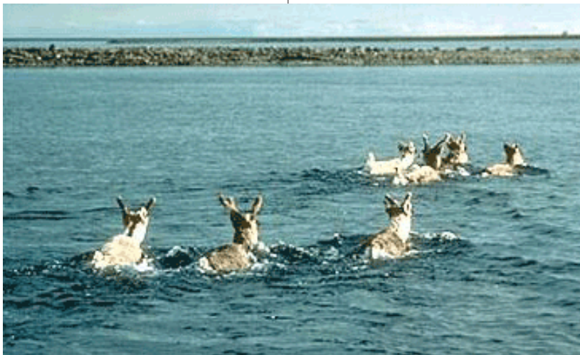
Caribou Crossing River

The economic importance of harvested wildlife would be clear if those same food items had to be purchased. In 1990/01 the value of the subsistence food harvest was estimated to be $50 - $55 million a year in terms of imports replaced. This replacement value represents one important part of the contribution wildlife makes to the NWT economy. Money spent on imports is a loss to the northern economy. The sustainable use of local resources needs to be a primary objective in any economic development strategy.