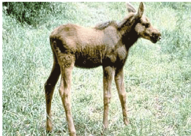
Moose Calf

An increase in responsible wildlife harvesting combined with applied agri-food science and research for commercial use has the potential to add significant economic benefits to this sector. Throughout the NWT, co-management boards have been set up to share wildlife management responsibilities between aboriginal user groups and government. This has provided an opportunity to integrate traditional knowledge and science for the benefit of the wildlife resource. Important liaisons have also evolved with federal agencies to include Agriculture and Agri-foods Canada and the Canadian Food Inspection Agency. The bringing together of skills, knowledge and applied science have facilitated the potential for economic benefits which up until a few years ago seemed remote or out of reach.