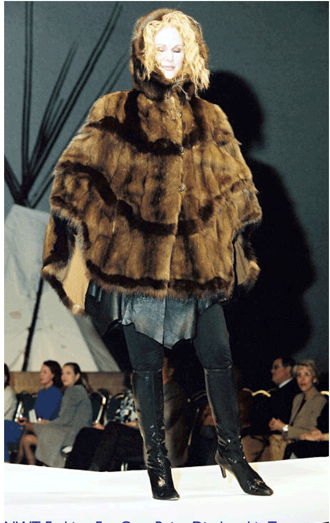
NWT Fashion Fur Coat Being Displayed in Texas Fashion Show (RWED, GNWT)

Building alliances with other fur producing regions, especially in northern Canada, may shelter risks and aid the industry in the NWT by adding strength in numbers and volumes when presenting furs to the world market. Marketability of fur from the NWT will need to address an external challenge that appears to be emerging. The recent announcement of the Federal Government's reluctance to continue with funding trap research in support of export markets could pose problems for the free trade of fur to the European Union. This must be addressed soon or barriers may be re-erected in Europe if it is determined Canada is renegeing on obligations entered into in the bi-lateral Agreement on International Humane Trapping Standards.