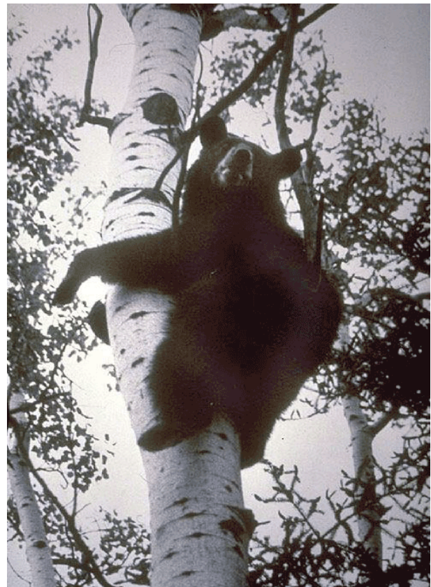
Blackbear in the Woods

One area of promise emerged during these years involving the development of qivuit products and markets. In more recent years, the development of markets for qiviut (musk-oxen under-fur) has been a priority and in 1999 these efforts began to pay off. In addition to the sale of meat from the 1999 harvest of 1,450 animals, the value of the qiviut and leather increased the total NWT value of the harvest. Qiviut production continues to gain strength and provides positive contributions towards harvesting costs.