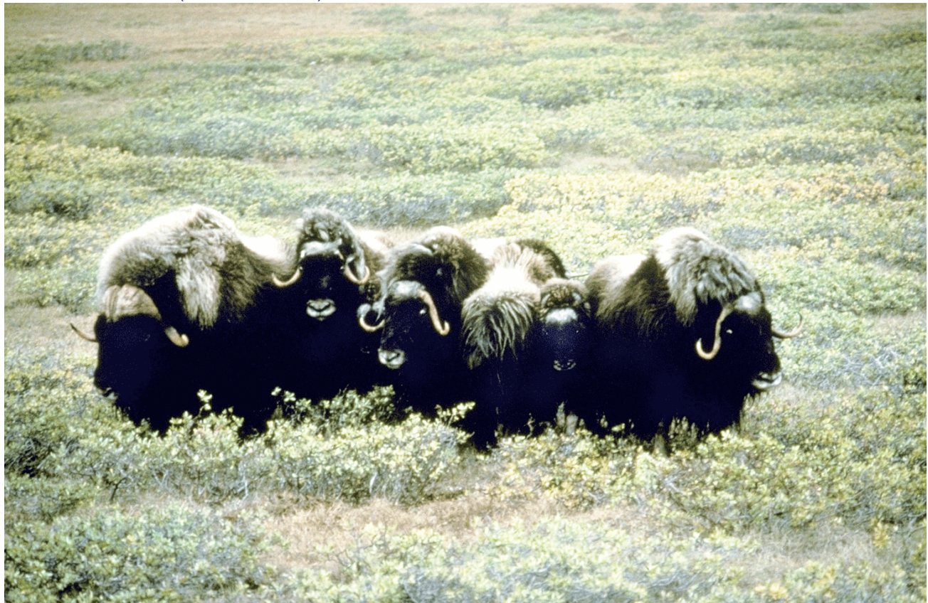
Muskox in a Circle

The Governments of Canada and the NWT have recently signed the Canada--NWT Agriculture Policy Framework Agreement that will provide a source of investment to the export game meat industry through 2008. The aim of this investment will be to improve the quality and consistency of the product and develop long-term markets all the while reducing the risks associated with this type of work.