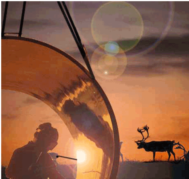
Welder With Caribou Crossing (RWED, GNWT)

The wildlife sector is of vital importance to the people and economy of the NWT. Traditional harvesting for food provides a significant alternative to store-bought meat and fish. Commercial activities, such as trapping and commercial harvesting, provide opportunities to earn income that are compatible with traditional skills and lifestyles. Wildlife is important from a tourism perspective and provides opportunities for recreational hunting as well as non-consumptive activities such as wildlife viewing, and photography.